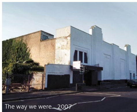
The way we were... 2007