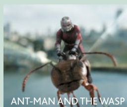
ANT-MAN AND THE WASP