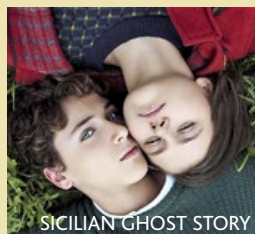
SICILIAN GHOST STORY