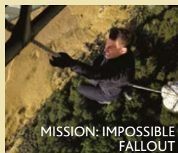
MISSION: IMPOSSIBLE FALLOUT