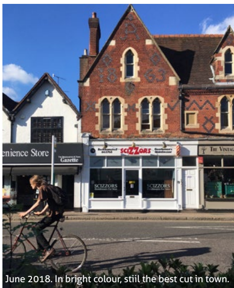
June 2018. In bright colour, still the best cut in town.