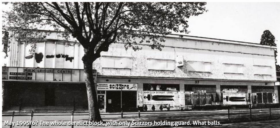
May 1995/6? The whole derelict block, with only Scizzors holding guard. What balls.