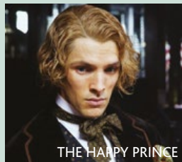
THE HAPPY PRINCE