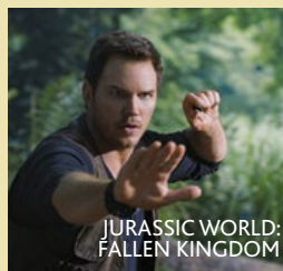
JURASSIC WORLD: FALLEN KINGDOM