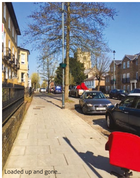
Loaded up and gone...

Ps... if you have fallen for (or off) one of our camping chairs, they're here, going for a fiver each.