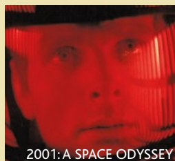
2001: A SPACE ODYSSEY