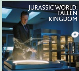
JURASSIC WORLD: FALLEN KINGDOM