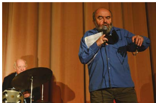
The Humphrey Lyttelton Band, back at The Rex Saturday 31st October, hosted by Andy Hamilton (above.)