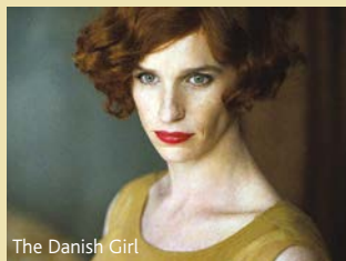
The Danish Girl