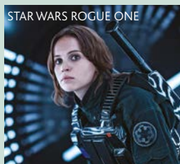
STAR WARS ROGUE ONE