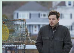
MANCHESTER BY THE SEA

MANCHESTER BY THE SEA A UNITED KINGDOM STARS WARS ROGUE 1 LA LA LAND