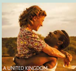
A UNITED KINGDOM