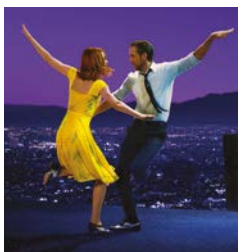
LA LA LAND