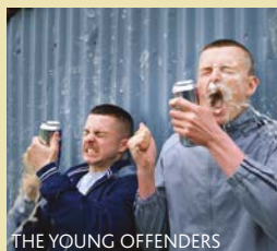
THE YOUNG OFFENDERS