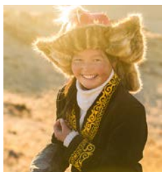
THE EAGLE HUNTRESS