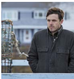
MANCHESTER BY THE SEA