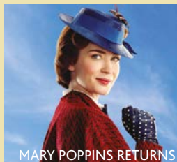
MARY POPPINS RETURNS