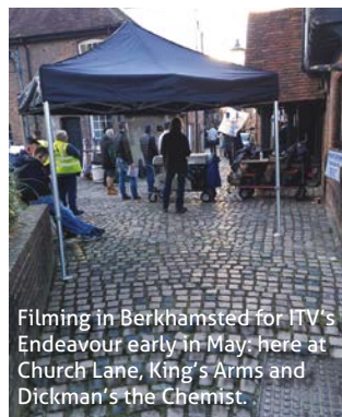
Filming in Berkhamsted for ITV's Endeavour early in May; here at Church Lane, King's Arms and Dickman's the Chemist.