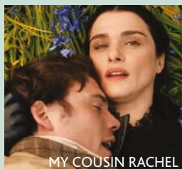
MY COUSIN RACHEL