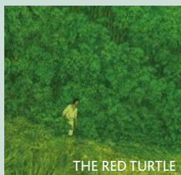
THE RED TURTLE

WONDER WOMAN MY COUSIN RACHEL COLOSSAL RED TURTLE KING ARTHUR PIRATES OF THE CARIBBEAN