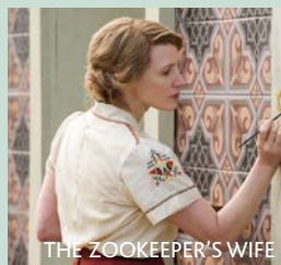
THE ZOOKEEPER'S WIFE