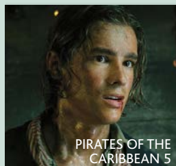
PIRATES OF THE CARIBBEAN 5

OTHER SIDE OF HOPE THE HIPPOPOTAMUS MY LIFE AS A COURGETTE GUARDIANS OF THE GALAXY 2 MINDHORN