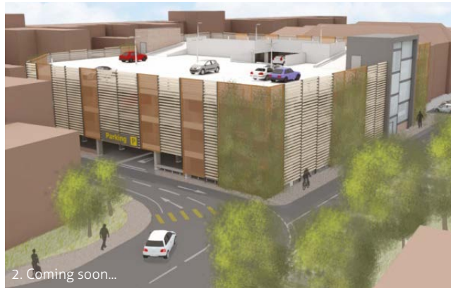
2. Coming soon...