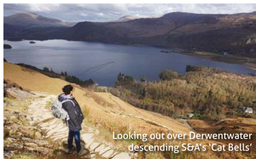
Looking out over Derwentwater descending S&A's 'Cat Bells'