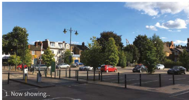
1. Now showing...

The DBC cite the Berkhamsted Chamber of Commerce in favour. We know they’re shop keepers, minnows, attracting 14 passers-by a day. The Chamber does NOT have a block vote, though favoured councillors make it sound so. Remember that. The amateur councillors are there to represent us, you and me, to uphold our vital democracy. Not their opinions. Moreover, these Town-life changing decisions are in the hands of lack lustre amateurs. Remember this most of all. Thursday 29th September at Dacorum Civic Centre. 7pm the Development Control Committee (the most powerful of all decision-making council committees by amateur councillors, advised by professional Town Planners. They’re the ones you pay too much for guessing. They must persuade those hapless amateur councillors you voted for, to guess with them, in your ‘best interest’. They stay paid, win or lose. Berkhamsted people should be there. No more guessing. I’ll be there too. Don’t miss.