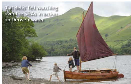
'Cat Bells' fell watching over the S&As in action on Derwentwater