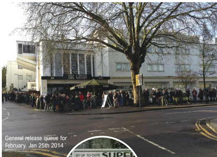
General release queue for February. Jan 25th 2014

“An up to date SUPER CINEMA and CAFÉ with accommodation for 1,300 persons together with SHOPS. FLATS and LARGE CAR PARK