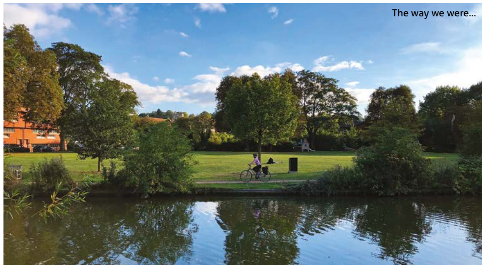
The way we were...

"You can't stop whats comin' – they ain't all waitn' on you... All the time you spend trying to get back what's been took from you – more of it is goin' out the door..." (No Country For Old Men 2008) I promised to give the car lump a rest. Well, "now that you've had your drink.." This ugly concrete sky thief, like a fat man eating, will grow fatter and uglier and very soon.