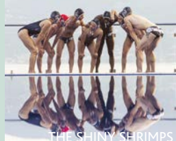
THE SHINY SHRIMPS