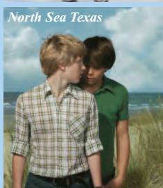
North Sea Texas