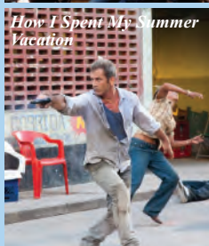
How I Spent My Summer Vacation