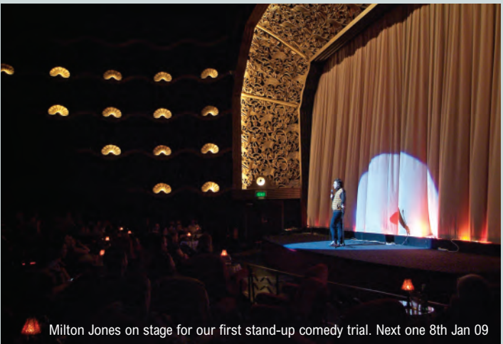
🔥 Milton Jones on stage for our first stand-up comedy trial. Next one 8th Jan 09