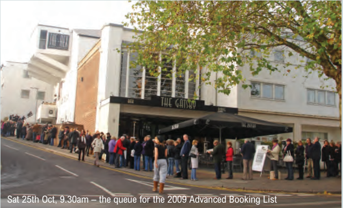
Sat 25th Oct, 9.30am – the queue for the 2009 Advanced Booking List