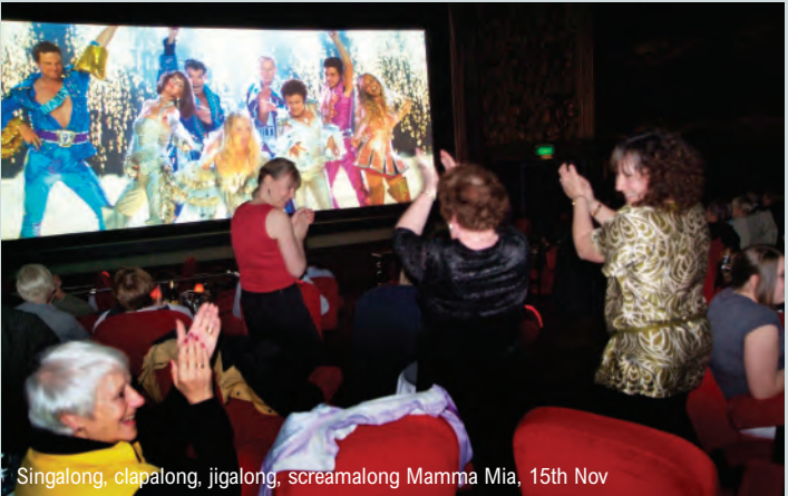
Singalong, clapalong, jigalong, screamalong Mamma Mia, 15th Nov