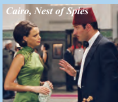
Cairo, Nest of Spies