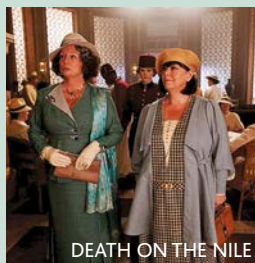
DEATH ON THE NILE