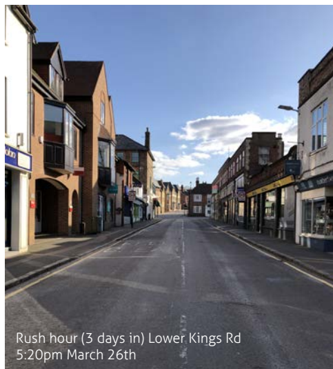
Rush hour (3 days in) Lower Kings Rd 5:20pm March 26th