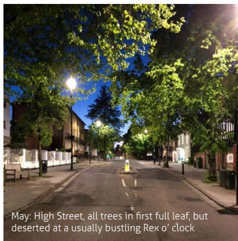
May: High Street, all trees in first full leaf, but deserted at a usually bustling Rex o' clock