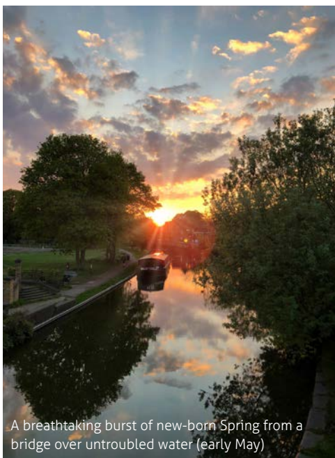
A breathtaking burst of new-born Spring from a bridge over untroubled water (early May)