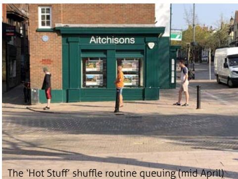
The 'Hot Stuff' shuffle routine queuing (mid April)