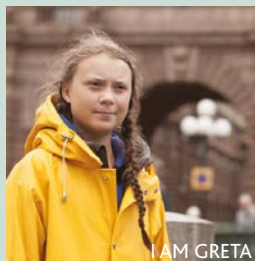
I AM GRETA