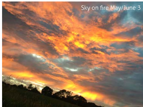
Sky on fire May/June 3