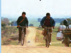
El Bano del Papa